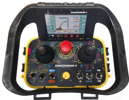
Console via cavo by AUTEK Cable remote console by AUTEK