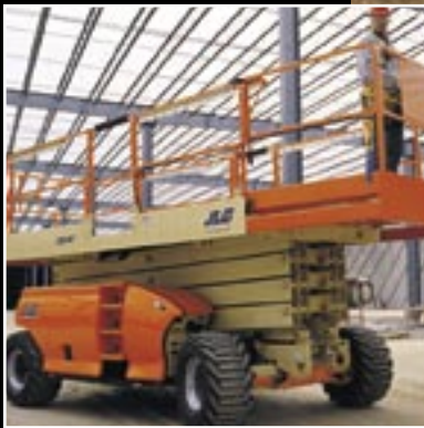
Wide Platforms Get You Closer to Your Work Area