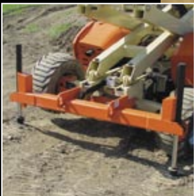
Optional One-Touch Leveling Jacks for Faster Set Up