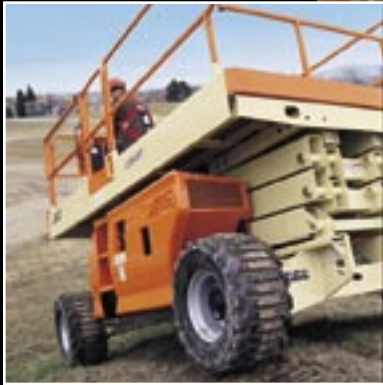
Twin Pump Power Delivers Unmatched Terrainability